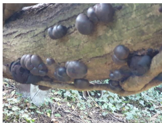
Fungus on a dead tree - King Alfred's Cakes?

There are now over 70 Friends. If your family, friends and neighbours would like to get involved ask them to contact us on fofows@gmail.com