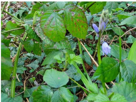
English Bluebell? In The Orchard