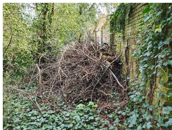
Could there be hedgehogs in here?