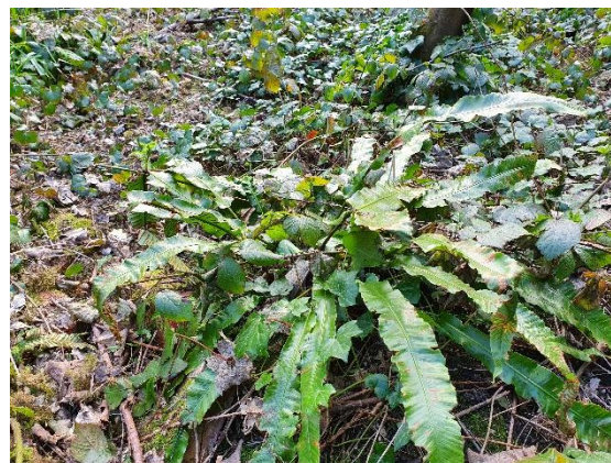
Hart's Tongue Fern

We would love to hear from you. If you have an article, news item or photograph, do send it in, especially if you use the app to identify something on Finchley Way Open Space. Please send contributions to fofwos@gmail.com