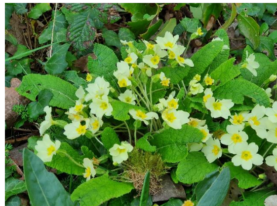
Common Primrose - at the top of The Green Field

Samuel also recommended "Picture This", an app that you can download for free. If you point it at a plant it will identify it for you. Other apps are available that do the same thing.