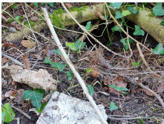
Possible fox den?

You can unsubscribe from this list at any time by emailing fofwos@gmail.com . You can request that all your details and email history be deleted at any time.