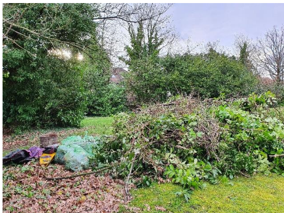
23 February - as well as the usual bottles and bags we found a dustbin, traffic cone and car number plate. There's more to collect!