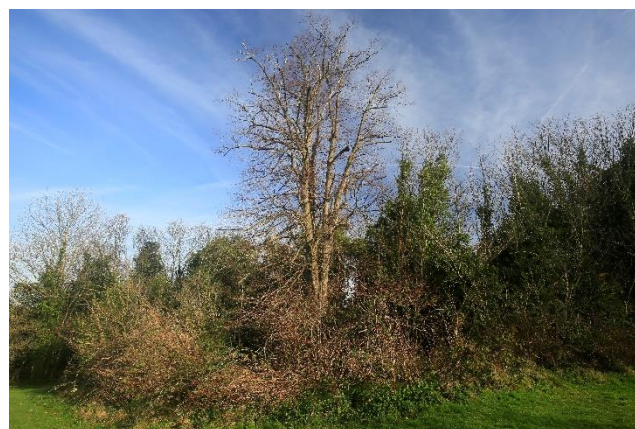
This tree in The Green Field may be dead - could it be the site of the tawny owl nest?

We aim to produce an outline plan for presentation to the next full Friends Meeting in April.