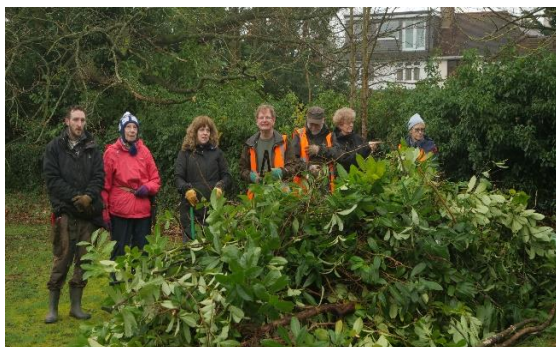
19 February - the team at the end of the day.

We have had two successful work parties. We have cut some ‘windows’ in the vegetation to open up the site to passers-by and cleared a lot of litter.