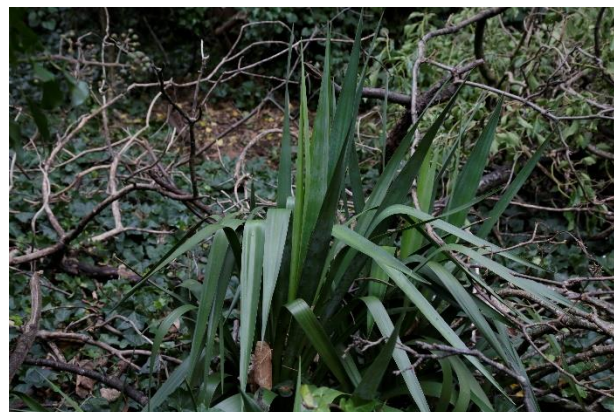
Anybody know what this is? It's growing in The Copse.

We have some people who can identify some species and will start our own surveys. If anybody has any skills in identifying species of flora or fauna and would like to help, please get in touch.