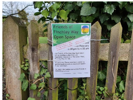
Poster for our last event

We now have over 70 Friends. If your family, friends and neighbours would like to get involved ask them to contact us on fofows@gmail.com