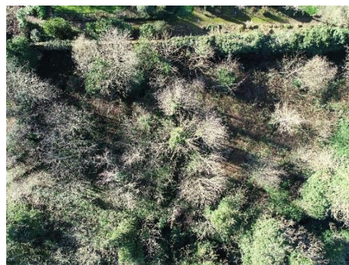
Aerial view of The Orchard