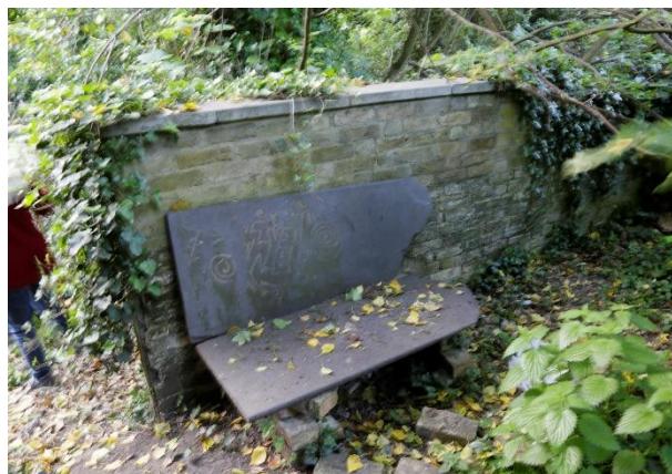
A seat in The Orchard made of slate - home-made?

Watch out for our forthcoming Instagram and Twitter pages.