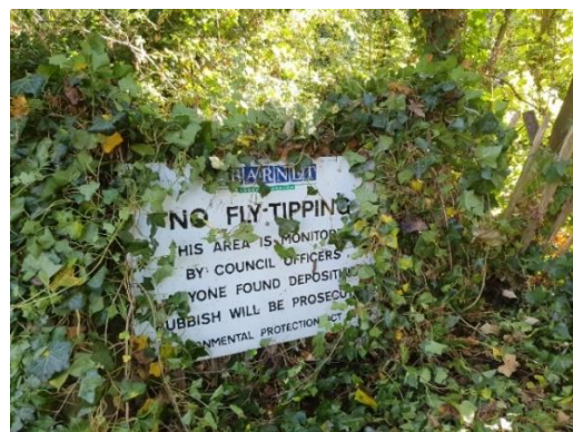
This sign and the fence have recently been flattened. We will try to put it back.

We are in contact with the Council over the future of the site and have the support of the West Finchley Ward Councillors.