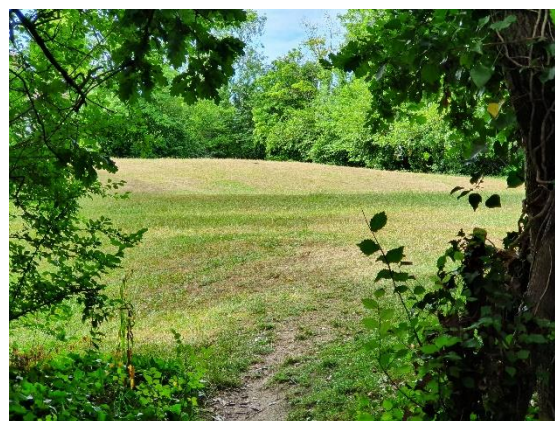
A reminder of summer

You can also access the Facebook page and our Instagram account and You Tube channel from our website: www.fofwos.org