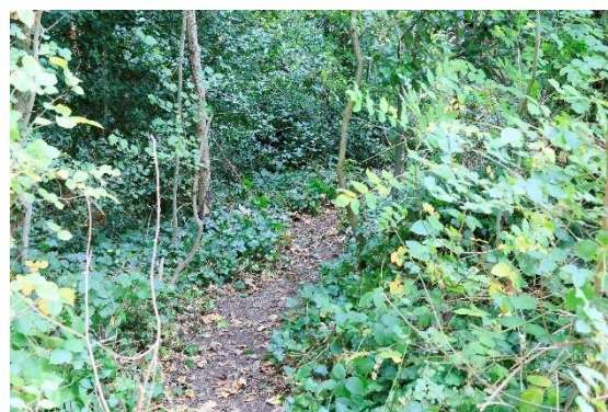
A new path into The Glade

The new path into the Copse was tidied-up, although there's still more to do on this. Another new path was cut through a different part of the Copse, an area we're now calling the Glade. There was also some exploration of the far side of the Copse which established that it's possible for the ecologist to have full access without cutting more access routes and the contractors have confirmed that this works for them.