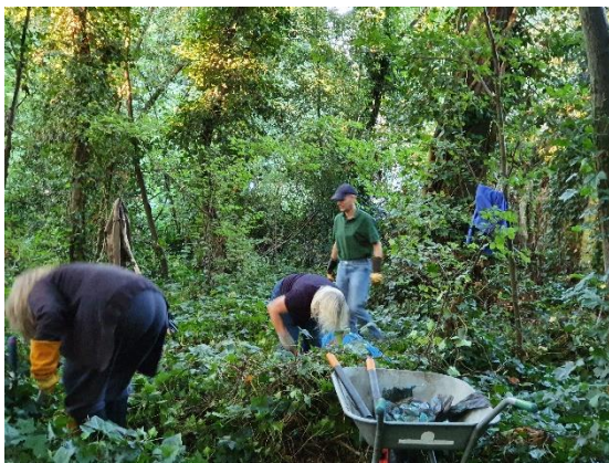
Work Parties hard at work

We may have other sessions to complete specific tasks as part of the initial renovations.