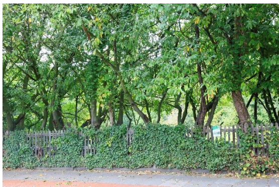
New "windows" into The Green Field

It's amazing what can be achieved in a relatively short time.