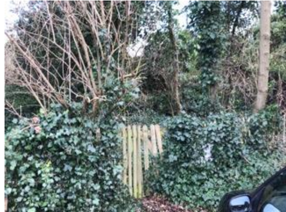
The Copse entrance from Hamilton Way

Facebook page - We now have 20 friends signed up to our Facebook page. If you'd like to join and contribute please visit: https://www.facebook.com/groups/1385689341590473/