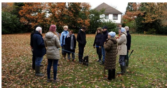
December 2019 Walk round

Friends - We now have over 50 Friends on our mailing list. If your family, friends and neighbours want to get involved, they just need to email the group at fofwos@gmail.com