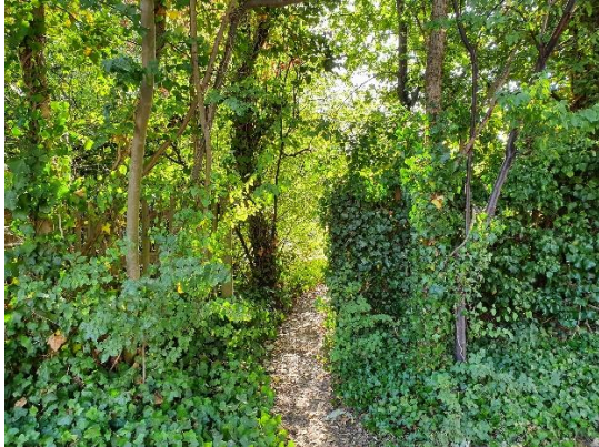
Green Field entrance from Hamilton Way