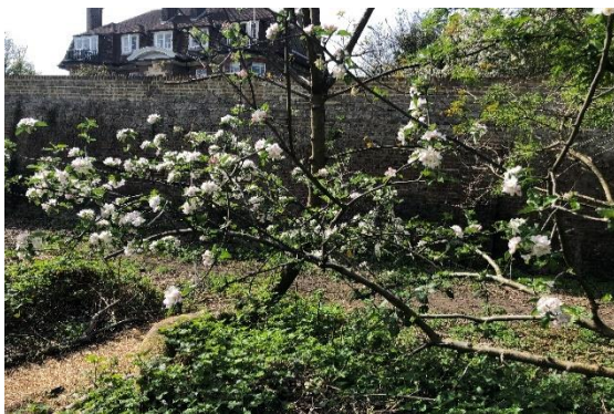
Apple tree ( Malus pulima )

Apple trees are in blossom and since opening-up the area more have flowered this year. Do go and explore!