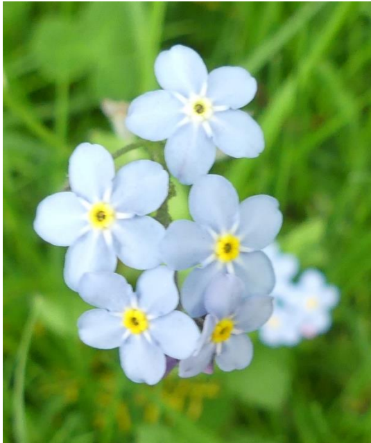
Germanda speedwell also known as Bird's or Cat's eye speedwell ( Veronica chamaedrys )

On the Green Field lots of tiny wildflowers are coming out. None of these were planted by us.