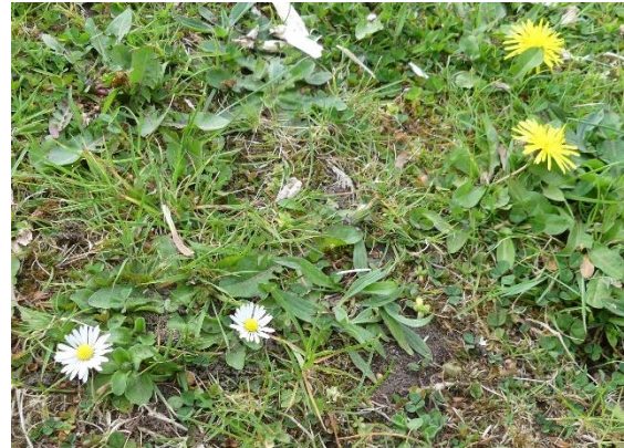
Daisies and dandelions

And, of course, there's the obvious daisies and dandelions.