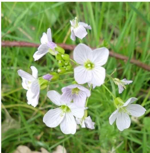
Cuckoo flower ( Cardamine pratensis )

The cuckoo flower is food for caterpillars and the orange-tip and green-veined butterflies. This could be why the children from the Nursery saw an orange-tip butterfly.