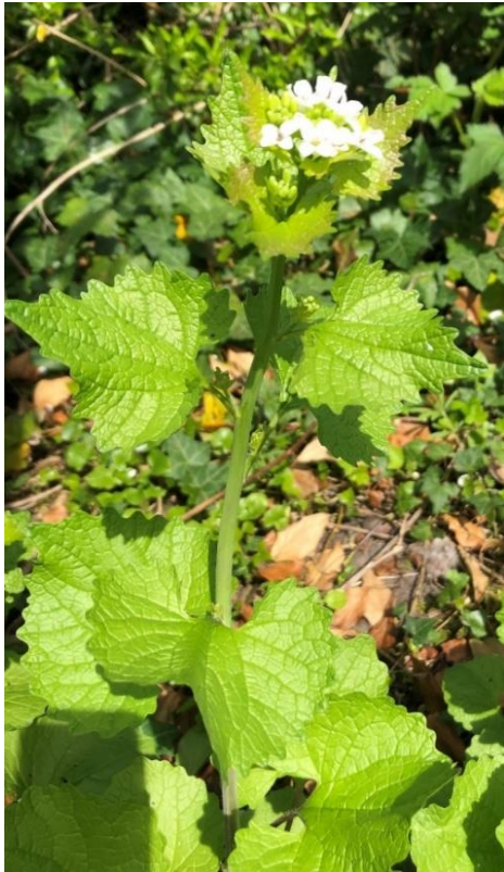
Garlic mustard also known as Jack-in-the-bush

Also, self-seeded is garlic mustard, which is also known as Jack-in-the-bush and Penny hedge ( Alliaria petiolata ). It smells of garlic to us and butterflies love its fragrant flowers.