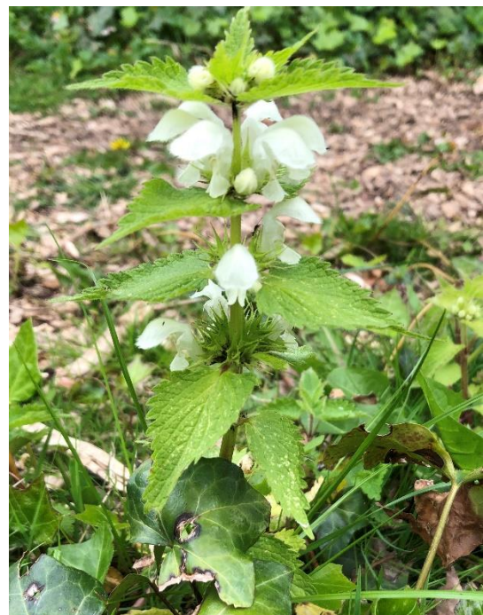
White deadnettle ( Lamium album )

White deadnettle is not as tiny as the others on the Green field featured here. It appeals to pollinators, particularly bumble bees.