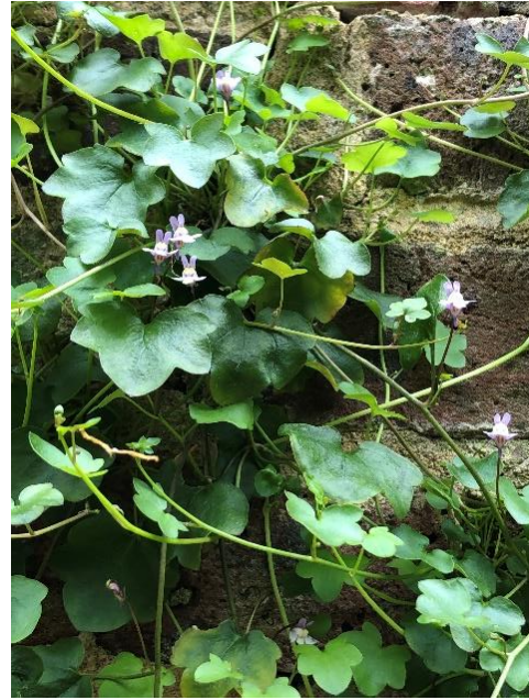
Ivy Leaved Toe Flax ( Cymbalaria muralis )

Ivy Leaved Toe Flax (next photo) is not originally native but it has been recorded in the wild in England since the 17 th century, so it meets our criteria and it's self-seeded in the Orchard.