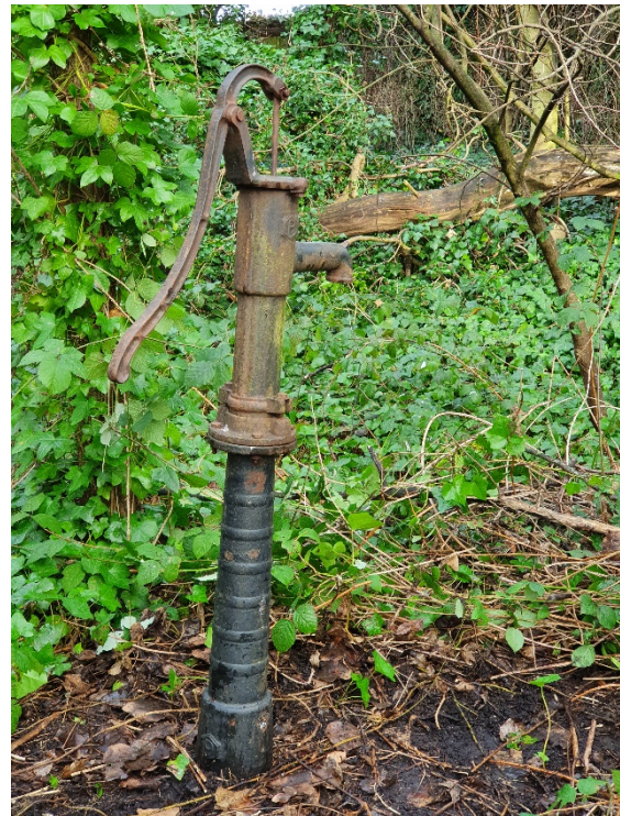
Another view of the pump. Anybody have any ideas about it?

https://www.facebook.com/groups/1385689341590473/