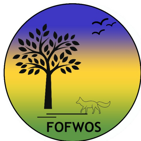
Our proposed Logo

Privacy Statement - we take your privacy seriously and do not pass on contact details to third parties. If you would like to see our statement, or if you would like to be removed from our contact list, please email fofwos@gmail.com